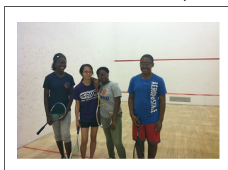
METROsquash students on court at the Henry Crown Field House.

My highlight was when I hit 25 backhands in a row. I had reached a new goal. I was trying to hit 10, but I was on a roll, so I kept at it and then I reached 15, then 20. Next thing I know I was at 25. I personally think backhand is the best. What I