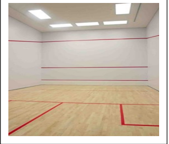
The 'T': where every squash player wants to be!

Squash is also as much as mental game as it is physical. Players who start with the basics, must learn the strategy and think while they play (almost like Chess on the move). Squash players cooperate to allow each other to play the ball, and at the same time they are trying to move them around the court and wear them out to exhaustion. To watch a squash match, pay attention to the following: players try to control the "T", the middle off the court. Good players cut the ball off as it is